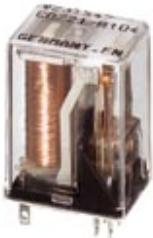
KAMMRELAIS ®, contact B 104, size 1, low-level contact, 2 PDTs, input voltage 120 V AC

Please be informed that the data shown in this PDF Document is generated from our Online Catalog. Please find the complete data in the user's documentation. Our General Terms of Use for Downloads are valid ( http://phoenixcontact.com/download )