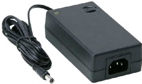
2.56"W x 4.65"L x 1.54"H