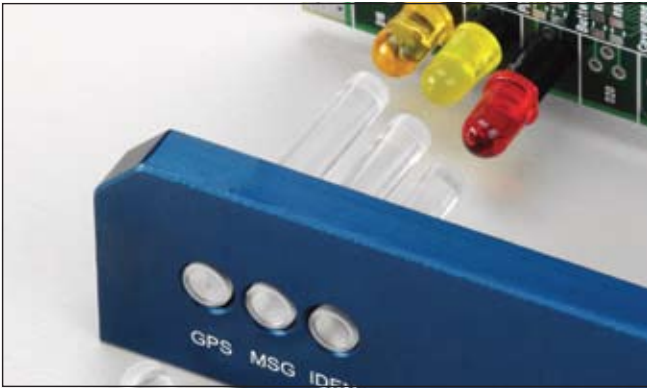
U.S. & Foreign Patents Issued and Pending