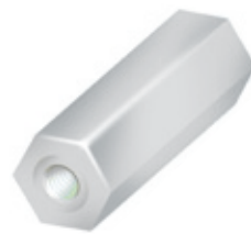
R30-101 Brass, Hexagonal M3, 5.5mm A/F