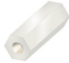
R30-161 Plastic, Hexagonal M3, 5.5mm A/F