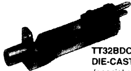
TT32BDC DIE-CAST FRAME (special order only)