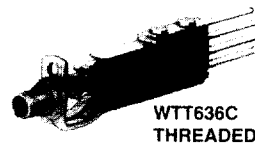
WTT636C THREADED BUSHING