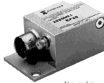
Not actual size