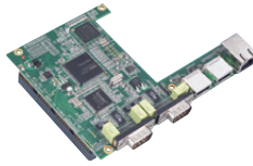
MIO-6260 Multi I/O Module with 1 Ethernet, 2 COM, 4 USB