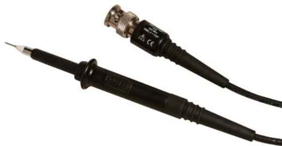
Model 6497 Modular Passive Oscilloscope Probe with Readout Actuator