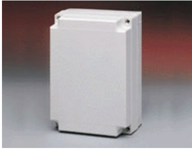
This is a sample photo.