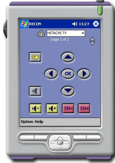
2 nd page of TV control