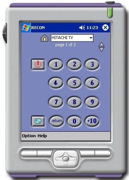
1 st page of TV control