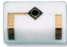
PD075-003-0xx Ceramic Sub-Mount