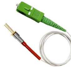
PD075-003-3xx SC/APC Pigtail