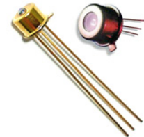
PD075-003-1xx TO can Package