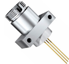
PD075-003-5xx FC Receptacle