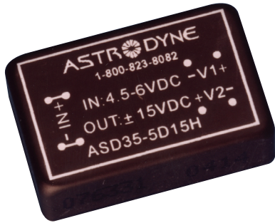
Unit measures 0.8"W x 1.25"L x 0.4"H