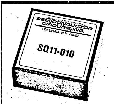
Case Size: See Page 12