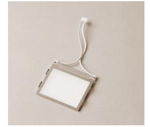
Photograph 1 Backlight Designed for Use with the ACX301AK