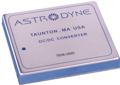
Unit measures 2.0"W x 2.0"L x 0.4"H