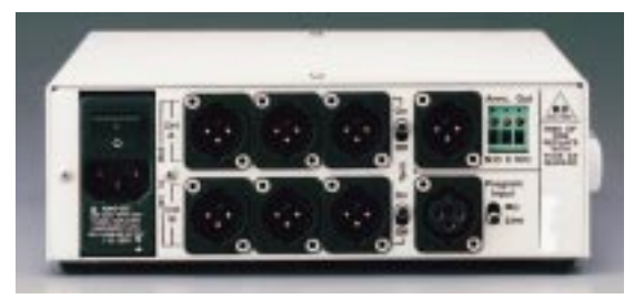
CS-222 Back Panel

through a headset, or external earphone or speaker. The 4-watt output amplifier can drive a standard Clear-Com headset to levels greater than 110 dB SPL – more than enough volume for the noisiest environment.