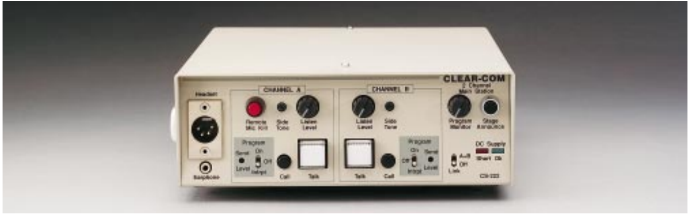
CS-222 Front Panel