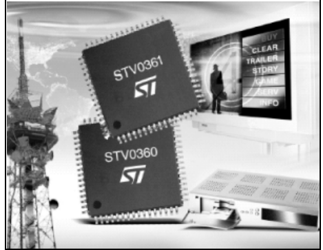
Figure 1. Package/ 64-pin TQFP